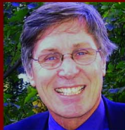
Bessel van der Kolk